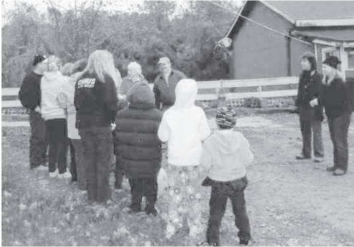
Last fall The Center took its child clients on an all day outing to the Turkey Hill Farm.

1993, The Center produced Hitting Home , a play that illustrated domestic violence and its relationship to teen dating violence and date rape. This began a successful nine-year outreach program using live performance as its primary vehicle. A second production, Red Tide , premiered in 1997 as a call to adolescent males to become part of the solution by taking a stand on preventing violence against women and girls. In addition, a middle school curriculum, Jesse's Journal , addresses those "blossoming" issues that relate to dating relationships i.e. body image, peer pressure, substance abuse and friendship.